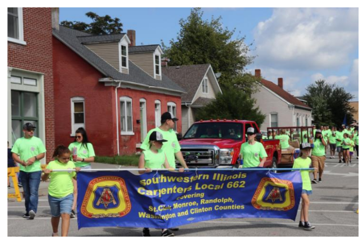
Local 662: Always a big turnout in Belleville...and always a big hit with Local 662's handcrafted rocking horses for the kids.