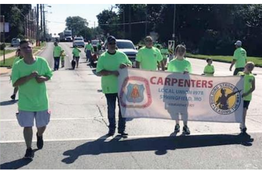
Local 978: Perfect day for a parade in Springfield, MO.