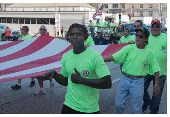
Regional Council: Showing off our union pride in downtown St. Louis.