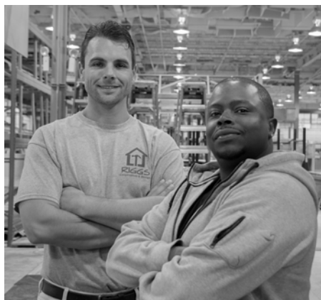
06. Best Buds