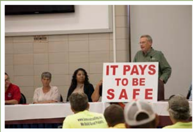
A fall protection safety lecture for employees of BAM Contracting was held in August at the Carpenters Hall, St. Louis.