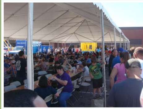
Sept. 17, 2016: More than 600 members and their families attend the Carpenters picnic in Kansas City sponsored by Locals 315, 777, 1127 and 1181.