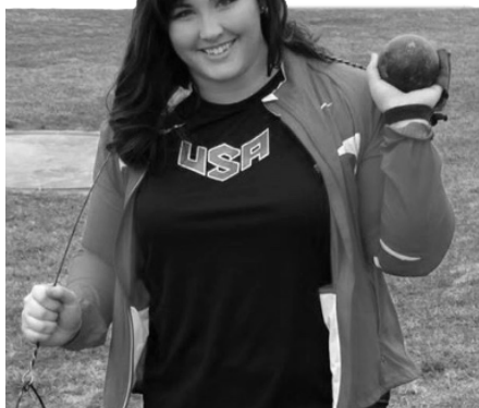
08. Pride & Joy