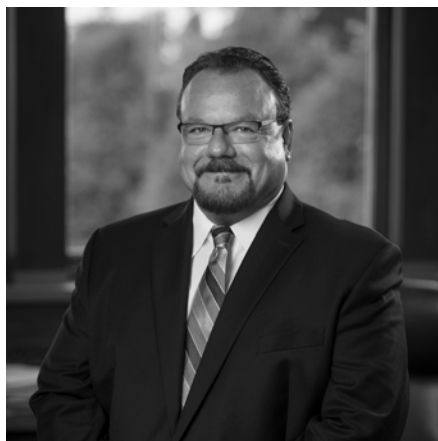
04. From the EST