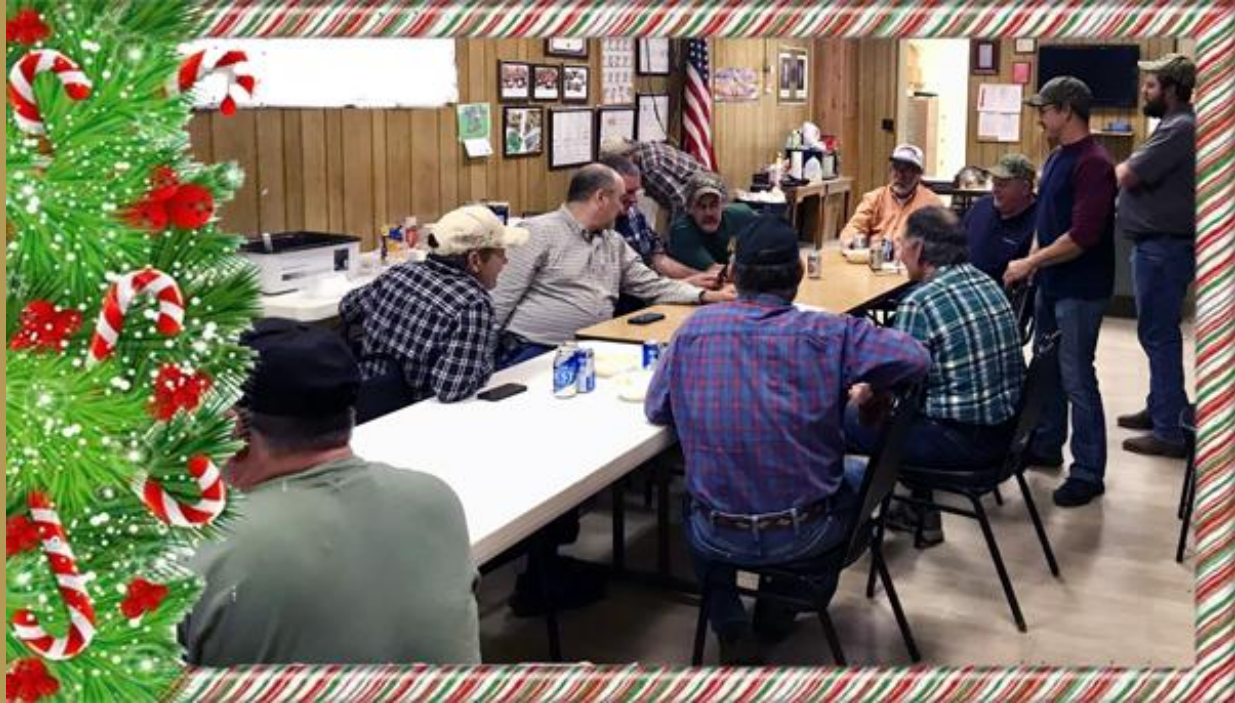
Dec. 5: Local 2030 spreads some holiday cheer at their annual Christmas party in St. Genevieve.