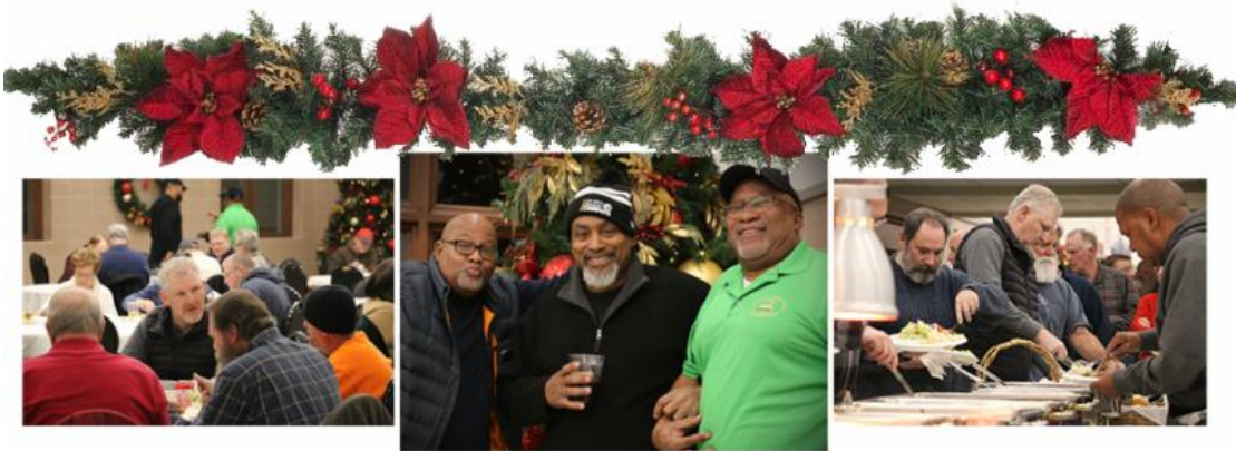
Dec. 5: Members of Local 1596 celebrate the holidays at their annual Christmas party at Carpenters Hall.